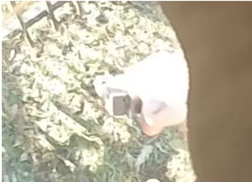
Photo of the firearm in the male's hand, captured from the officer's body worn camera