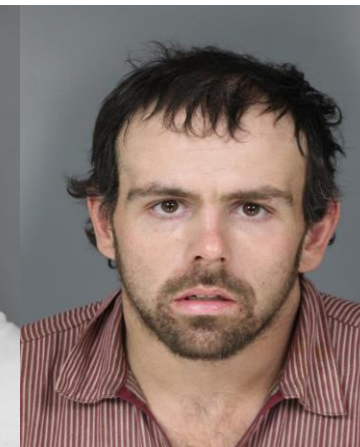
Brian Martin McKnight