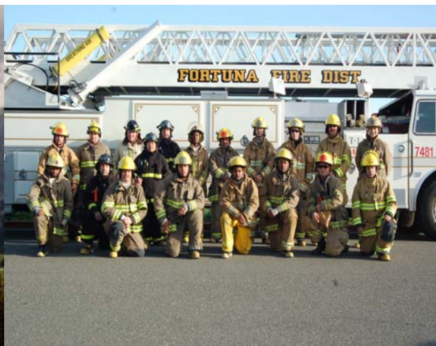
Left: Eel River Valley